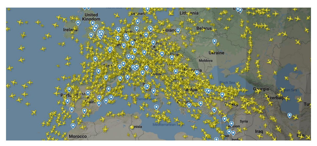
Figure 1: Planes over Europe, 2<sup>nd</sup> October, 2018 at 5:30 pm<sup>3</sup>

Anyone who at any given point in time looks at the planes simultaneously in the air over Europe (Figure 1), wonders involuntarily whether this picture represents an efficient and optimal system. It seems obvious that improvements would be conceivable.